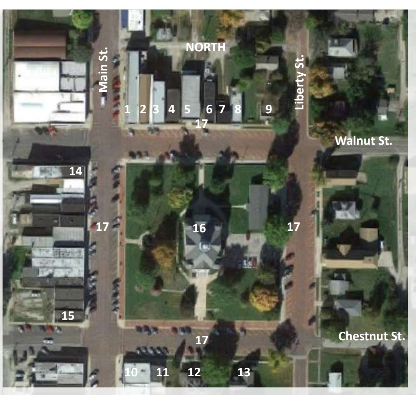
Doniphan County Courthouse Square Historical District

This two-story brick structure has pattern laid brick detailing on the façade. The 1899 fire destroyed Troy's hotel, the Higby House, located on this site. The disaster provided an opportunity to build a house benefiting the town's status as a successful county seat. A July 12, 1900 copy of the weekly Kansas Chief touted the new building as "a credit to the town and county." "Messr.s Graves and Briggs have spared neither time, labor nor expense to make everything comfortable, convenient, and up-to-date." The article went on to draw attention to hot and cold running water throughout the building, linoleum floors in the public spaces, oak furniture, heavy